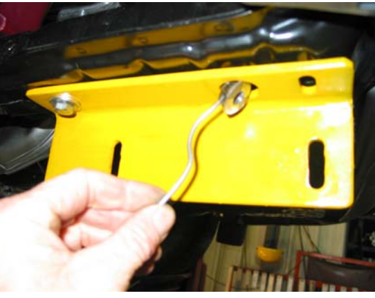
Figure 5 – Drivers side shown