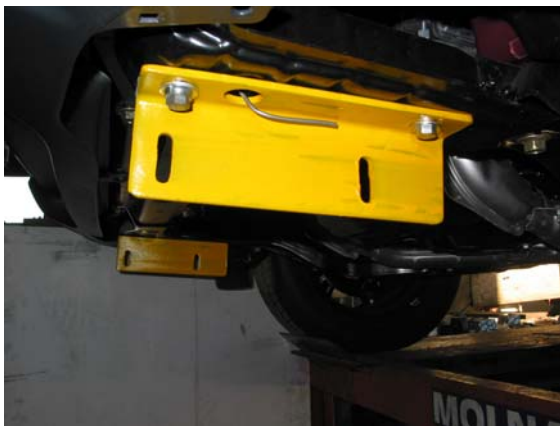
Figure 7 – View from passenger side