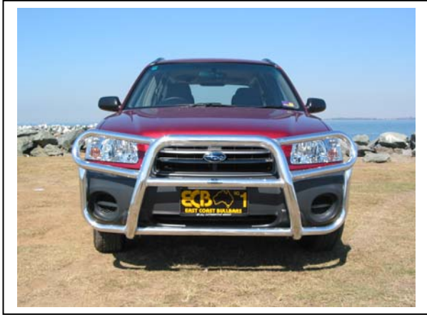
Figure 11 – Type 8 front view