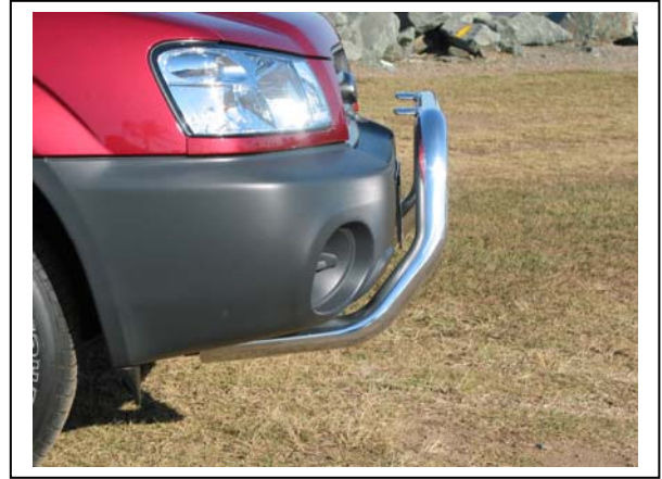
Figure 12 – 63mm Nudge Bar side view