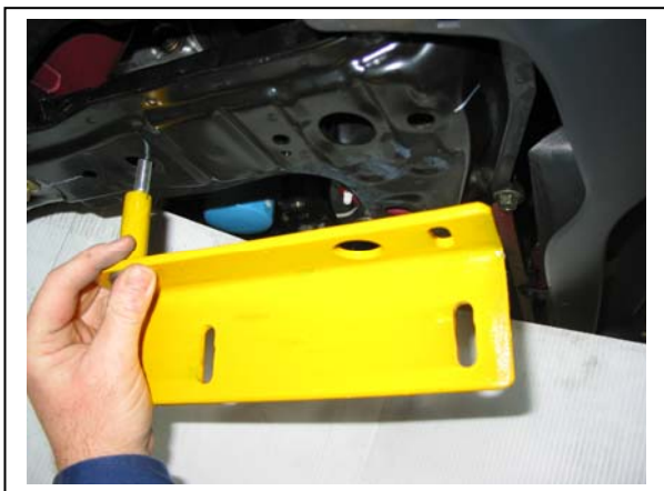
Figure 3 – Drivers side shown