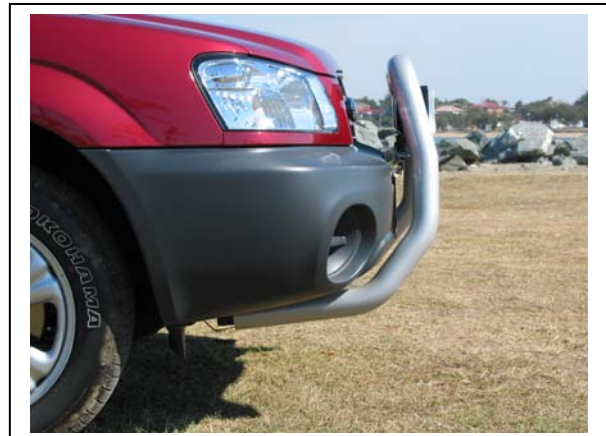
Figure 10 – Series 2 Nudge Bar Side view