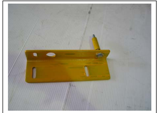
Figure 2 – Passenger side steel mount angle shown