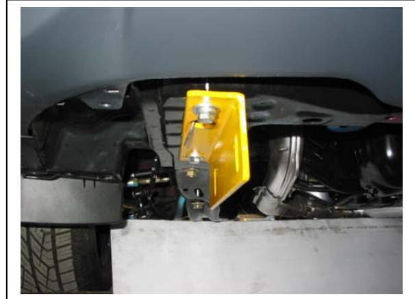
Figure 6 – Drivers side shown